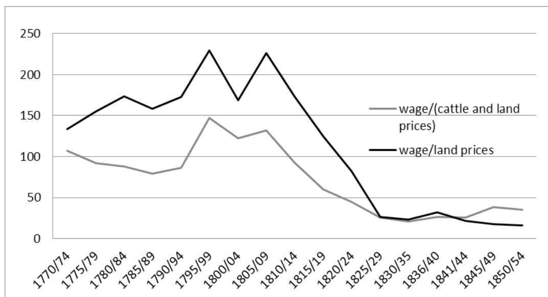
GRAPH 1 Relative factor prices, 1770-1854 (1770=100)